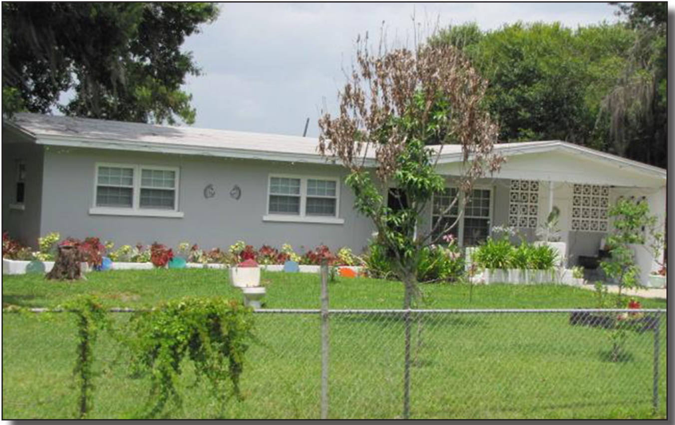
1,592± square foot, 2 bed/2 bath pool home